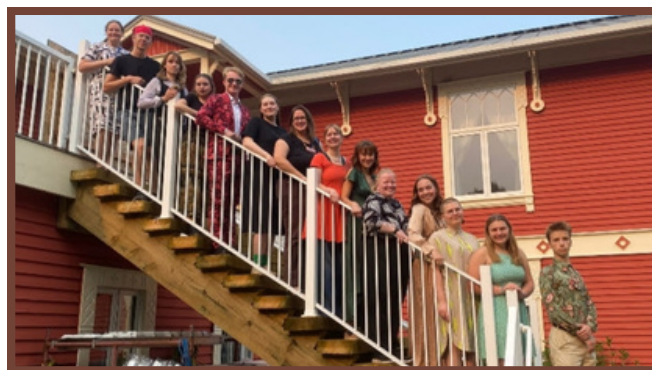
Top: Main staircase under construction Right: Completed staircase with staff